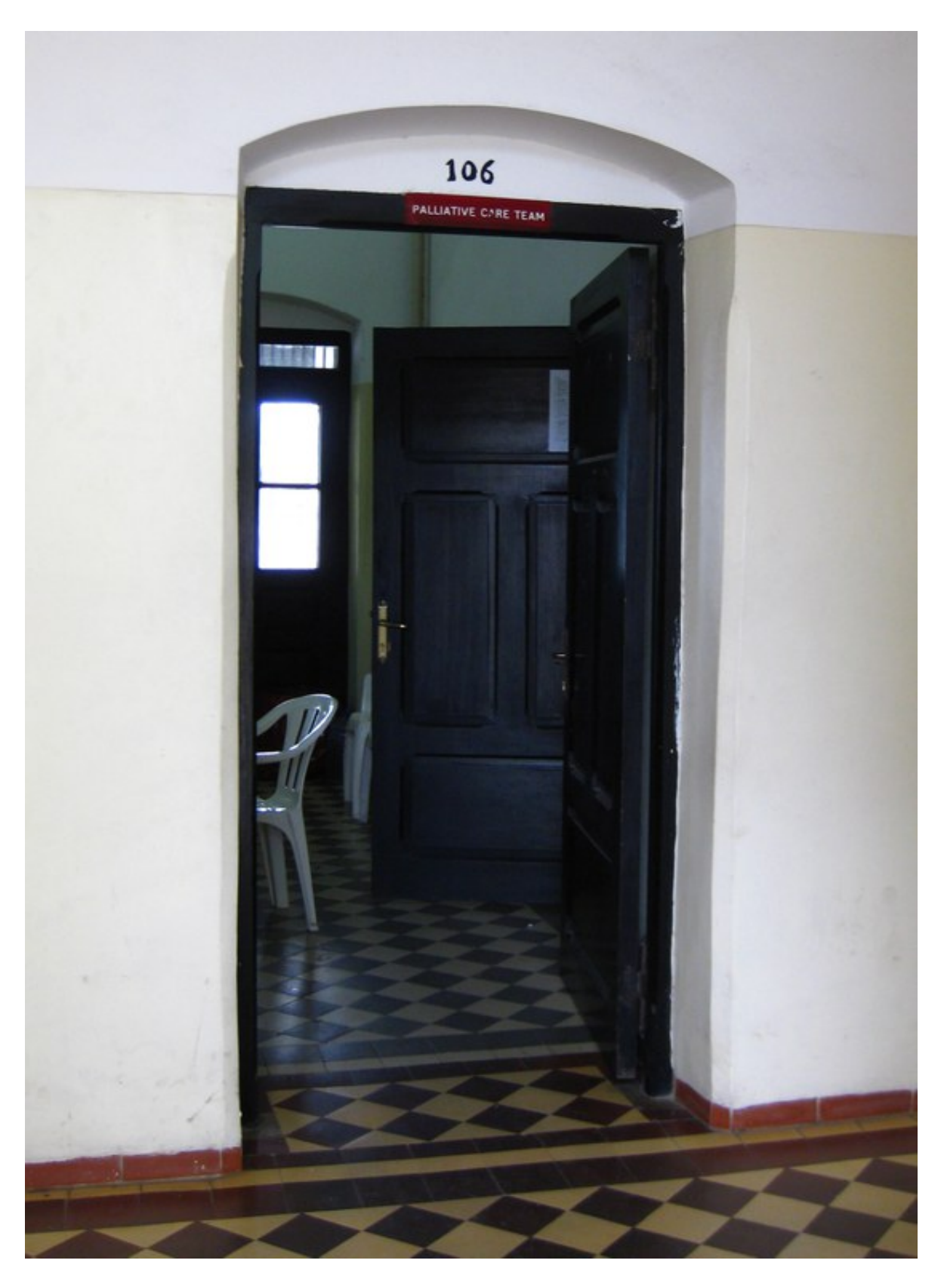
Palliative care counselling room at ORCI.

The majority of patients come from faraway places across the country and travel far to reach the hospital, often without accompanying relatives providing the necessary care. Thus, most of them are dependent on in-hospital support. The hospital palliative care team's duties are taking care of in-patients with palliative care needs, especially pain management, counselling outpatients and their relatives, organizing home-visits, and supporting and training hospital staff