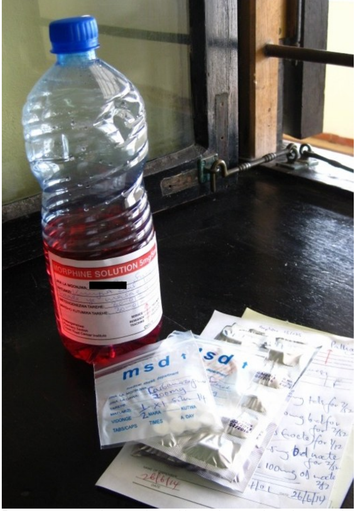
For most cancer patients, oral morphine and concomitant drugs are the preferred option to relieve pain – if available.