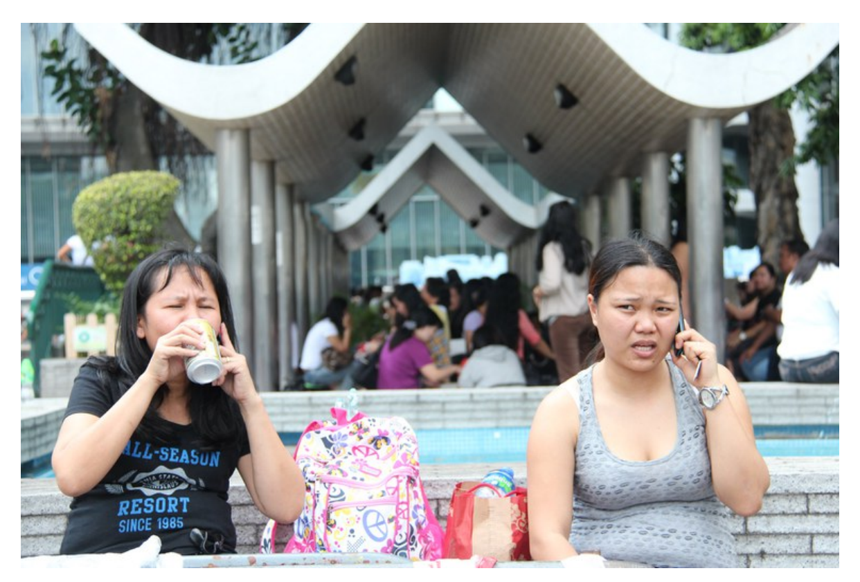
Calling Home: Migrant Workers in Hong Kong.

When in treatment for diabetes, migrants have a significant lower probability of adhering to guidelines or to be tested for HbA1c (glycated haemoglobin) measurement over time. (Ballotari et al. 2015; Seghieri et al. 2019) Social determinants plays also a role in the self-management of diabetes, but there is a significant lack of research in this respect regarding migrants.