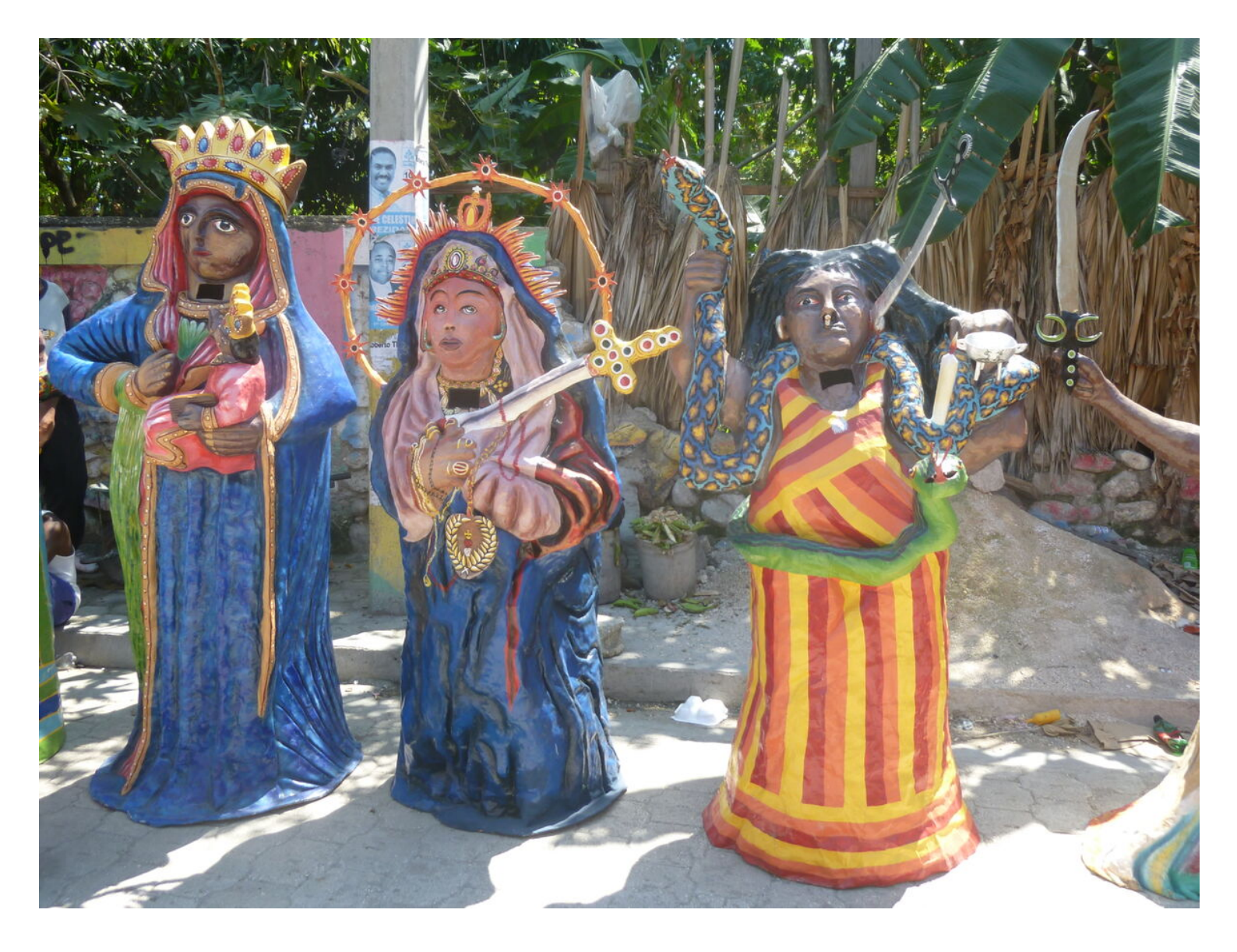
Carnival in Jacmel, Haiti, 2011

I studied psychology as my first degree. After graduation I feared I did not have the strength to face people with mental health disorders and I therefore specialised in public health. During three years living in developing countries I encountered many people with mental health disorders. In Haiti a naked woman ran around in the market and a man got drunk on a regular basis in front of our compound. In Myanmar we employed a doctor not realising that he was suffering from severe alcoholism. He failed to make it to the duty station because he got totally drunk on the way and did not stop drinking for four entire days. From one day to the next a young women had to take care of her entire family because her mother was arrested for having drugs in her house – drugs someone else had left there. Working with these communities, I looked into many sad and depressed eyes.