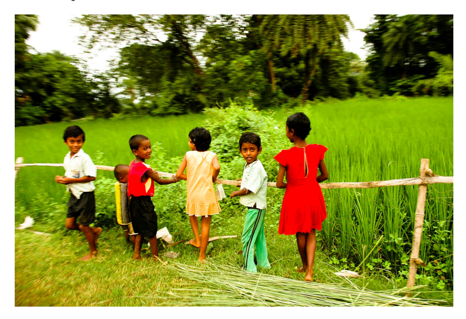
Thanks to MDT and the efforts of the WHO and the anti-leprosy

Significant progress in the fight against leprosy has been one of the greatest public health successes. Global figures from the World Health Organization (WHO) on leprosy highlight these early successes, showing that the global burden of leprosy has been reduced by 95% since the 1980s. But in recent years, the anti-leprosy work has become a victim of its own success: with patient numbers falling sharply, efforts to go the last mile in eliminating the disease have stagnated.