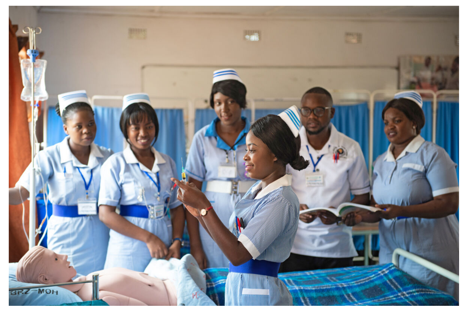
Third year nursing students practising techniques in the Skills Lab at St. Luke's College of Nursing in Mpanshya, Zambia.