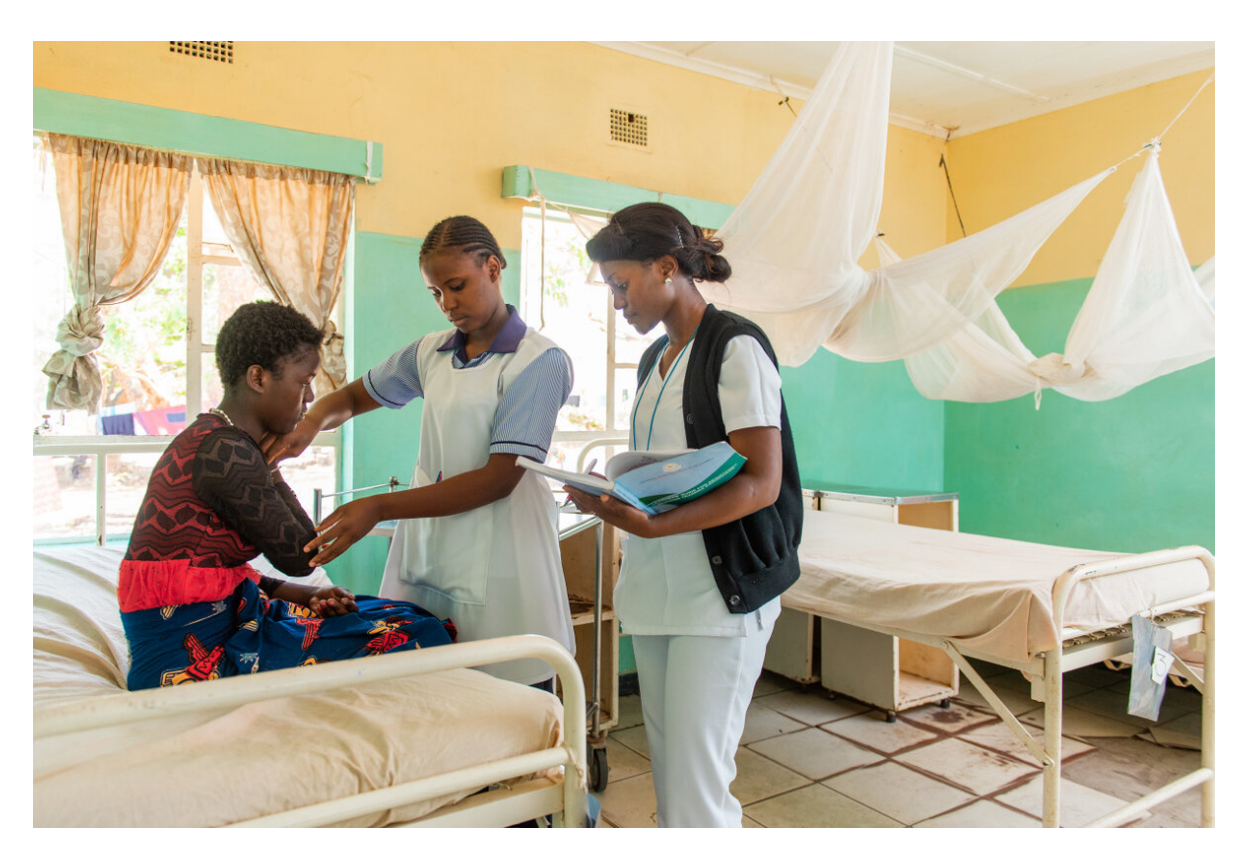
Student nurse attending a patient, overseen by a Clinical Instructor at St. Luke's Mission Hospital in Mpanshya, Zambia.

The success of the pilot has been recognised by the Ministry of Health and the NMCZ. St. Luke's School of Nursing and Midwifery, as well as the decentralised partner hospitals were accredited by the NMCZ thereby acknowledging that the quality standards for the students' training are met. This recognition has boosted interest in the model from other training institutions. In 2019, SolidarMed initiated support for two additional nurse training institutions to implement the decentralised model. These two nursing schools have begun implementation while some others are planning to implement the model even without SolidarMed support but using the developed guidelines. One of the key guiding documents that was published by the Nursing and Midwifery Council of Zambia with support of SolidarMed and the Ministry of Health in 2019 is the Decentralised Nurse Training Model Implementation Guide . It lays out the necessary steps for the implantation and successful running of the model and thus provides guidance to institutions who wish to adopt the decentralised model.