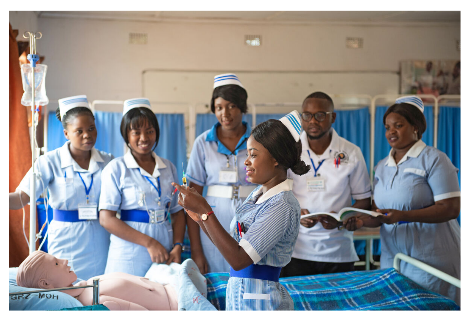
Third year nursing students practising techniques in the Skills Lab at St. Luke's College of Nursing in Mpanshya, Zambia.