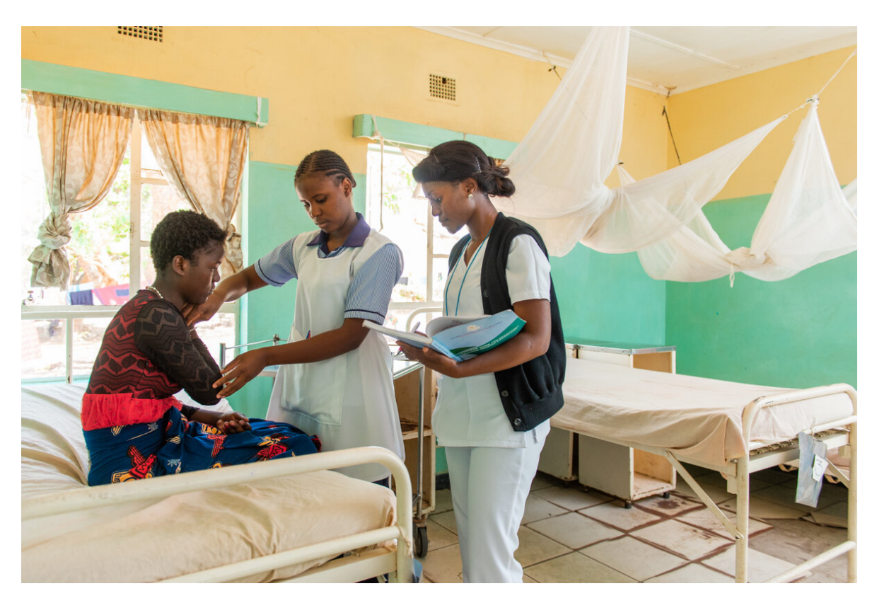
Student nurse attending a patient, overseen by a Clinical Instructor at St. Luke's Mission Hospital in Mpanshya, Zambia.

The success of the pilot has been recognised by the Ministry of Health and the NMCZ. St. Luke's School of Nursing and Midwifery, as well as the decentralised partner hospitals were accredited by the NMCZ thereby acknowledging that the quality standards for the students' training are met. This recognition has boosted interest in the model from other training institutions. In 2019, SolidarMed initiated support for two additional nurse training institutions to implement the decentralised model. These two nursing schools have begun implementation while some others are planning to implement the model even without SolidarMed support but using the developed guidelines. One of the key guiding documents that was published by the Nursing and Midwifery Council of Zambia with support of SolidarMed and the Ministry of Health in 2019 is the Decentralised Nurse Training Model Implementation Guide. It lays out the necessary steps for the implantation and successful running of the model and thus provides guidance to institutions who wish to adopt the decentralised model.