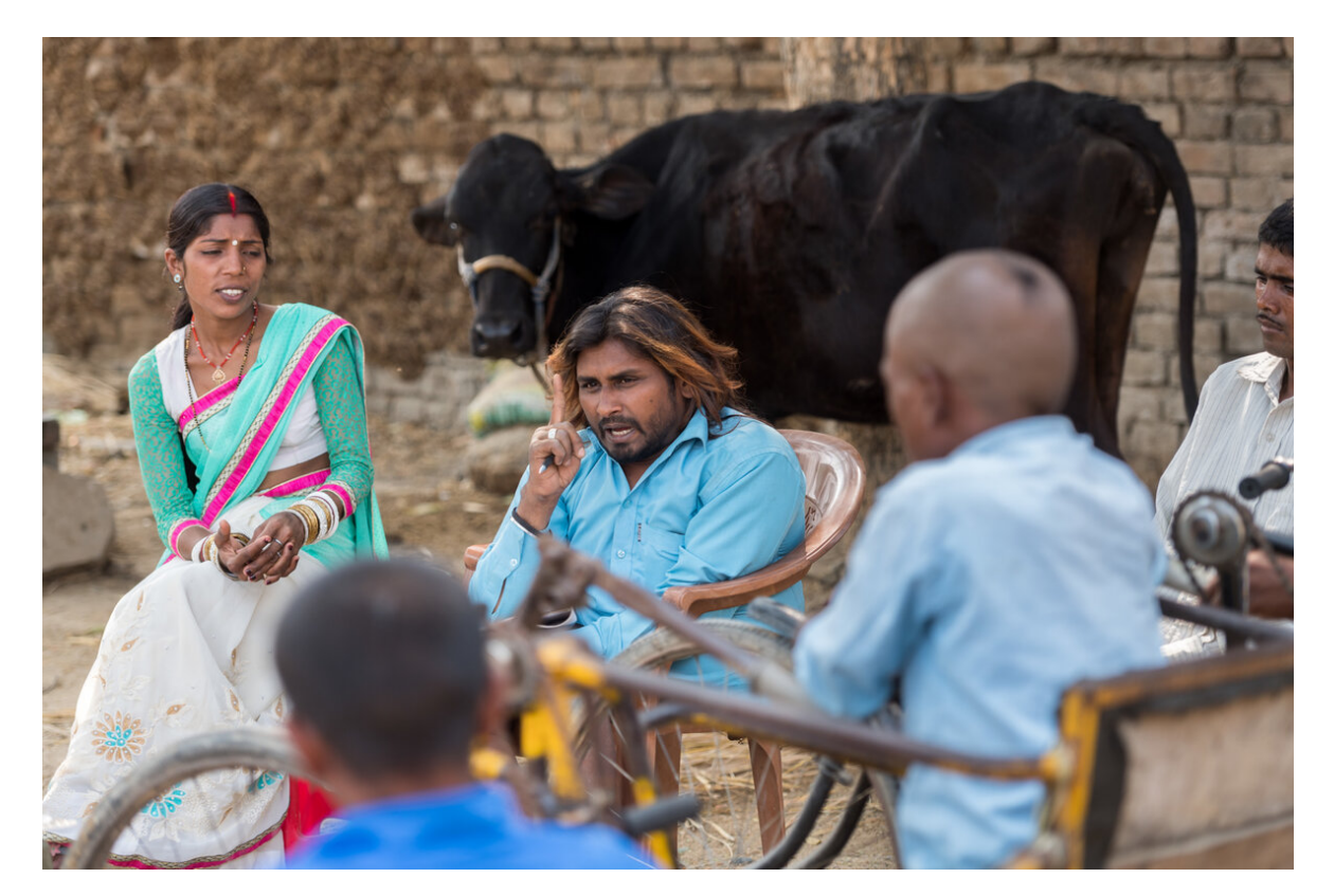
Reducing poverty in Bihar, India through a community based inclusive development initiative.

"All programs and projects in international cooperation must also collect data on disability and disaggregate along disability in order to track their quality and impact, and to make sure that persons with disabilities in general and specific groups of persons with disabilities are not left behind."