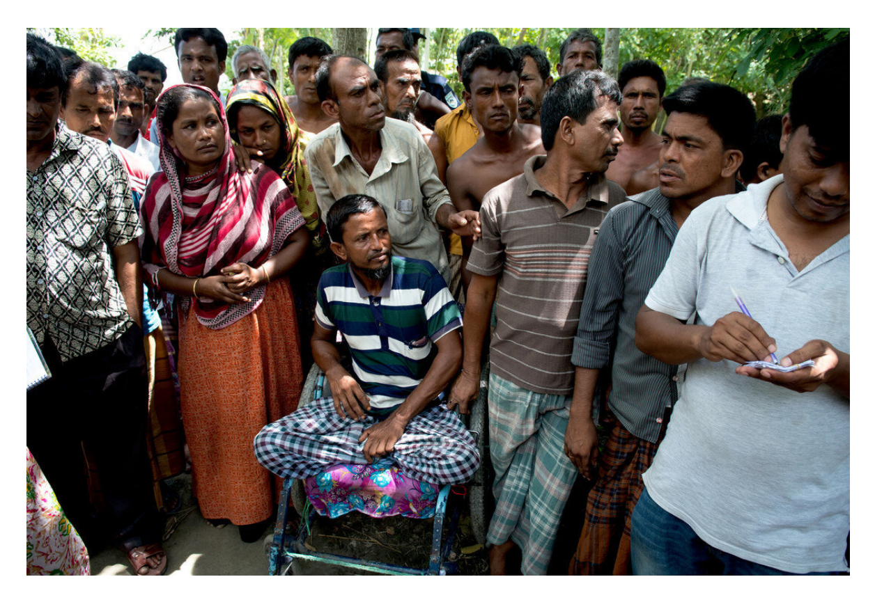
In Bangladesh following heavy flooding, CBM together with a partner organization supported persons with disabilities by providing unconditional grants and quality assistive devices.

"While promoting human rights and a rights-based approach in its international cooperation, Switzerland does not yet fully respect, protect and fulfill the rights of persons with disabilities in its international cooperation."