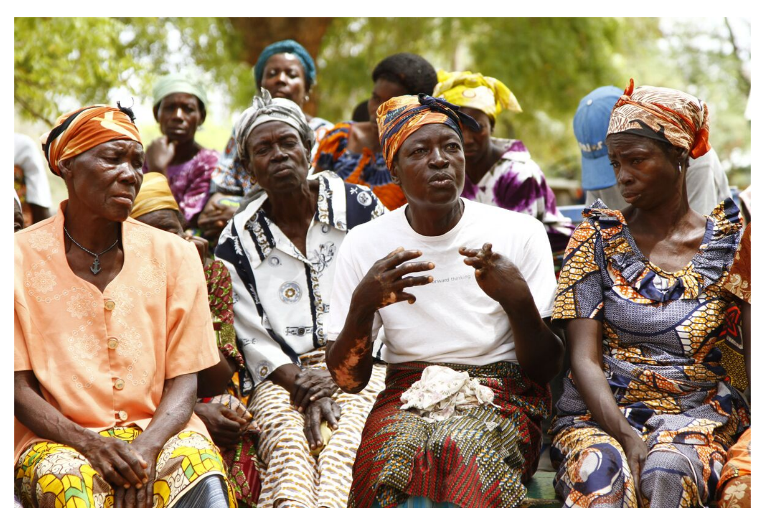
Women's self-help group in Ghana.