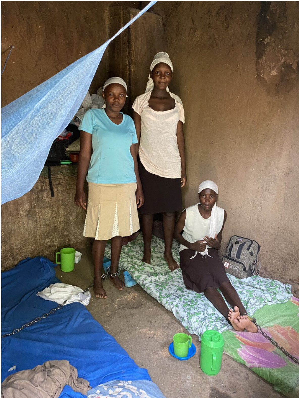
Two women are chained in a room at the Coptic Church Mamboleo, in Kisumu city, western Kenya, where over 60 men, women, and children with psychosocial disabilities are detained. They have to go to the toilet in front of each other, in a bucket in the room.

Along with sexual violence, women and girls with psychosocial disabilities also face violations of their reproductive rights. In some institutions in Indonesia where shackling is practiced, Human Rights Watch found women and girls with psychosocial disabilities were administered contraceptive injections without their knowledge or consent to prevent pregnancies as a result of rape by staff or male residents (Human Rights Watch, 2016, pp. 60-61).