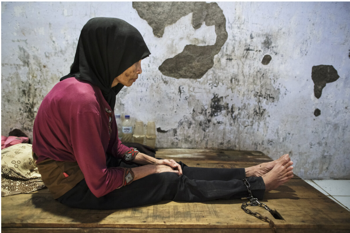
A young woman with a real or perceived psychosocial disability sits with her ankle chained to a platform bed at Bina Lestari faith healing center in Brebes, Central Java.