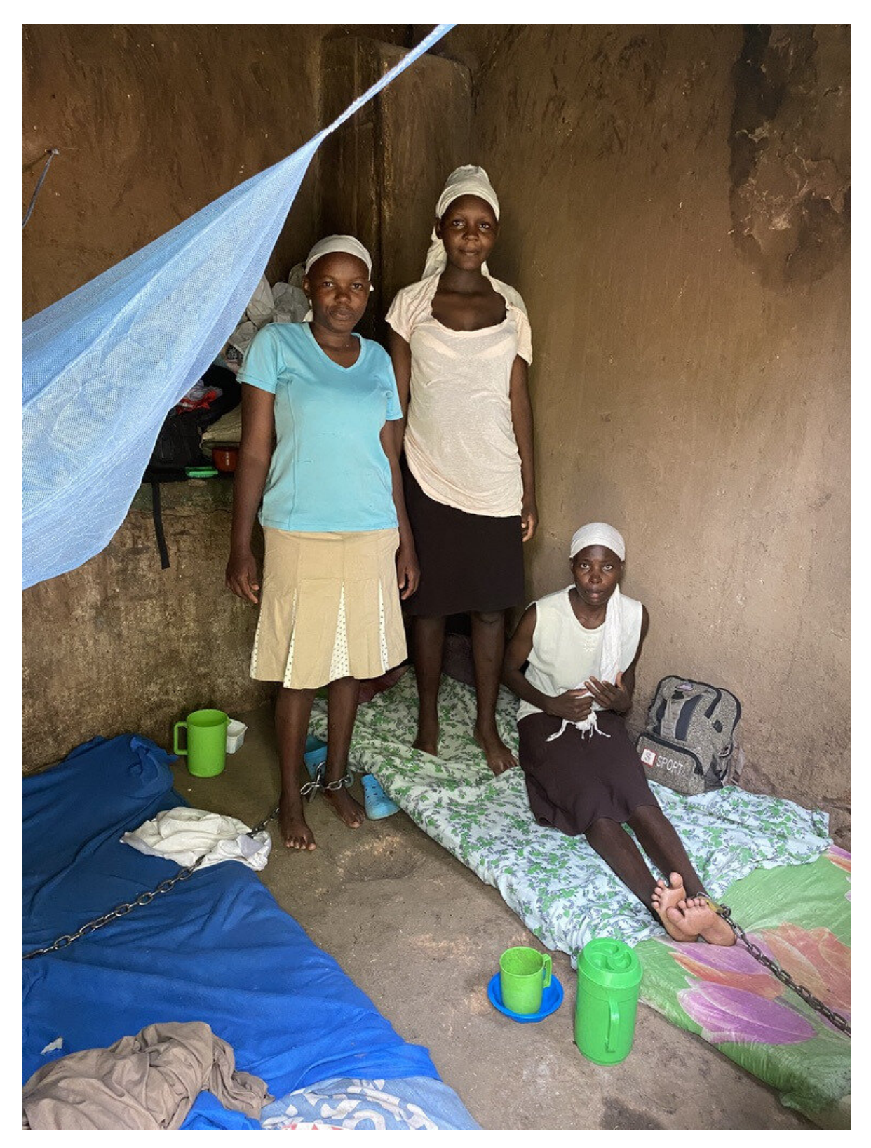
Two women are chained in a room at the Coptic Church Mamboleo, in Kisumu city, western Kenya, where over 60 men, women, and children with psychosocial disabilities are detained. They have to go to the toilet in front of each other, in a bucket in the room.

Along with sexual violence, women and girls with psychosocial disabilities also face violations of their reproductive rights. In some institutions in Indonesia where shackling is practiced, Human Rights Watch found women and girls with psychosocial disabilities were administered contraceptive injections without their knowledge or consent to prevent pregnancies as a result of rape by staff or male residents (Human Rights Watch, 2016, pp. 60-61).