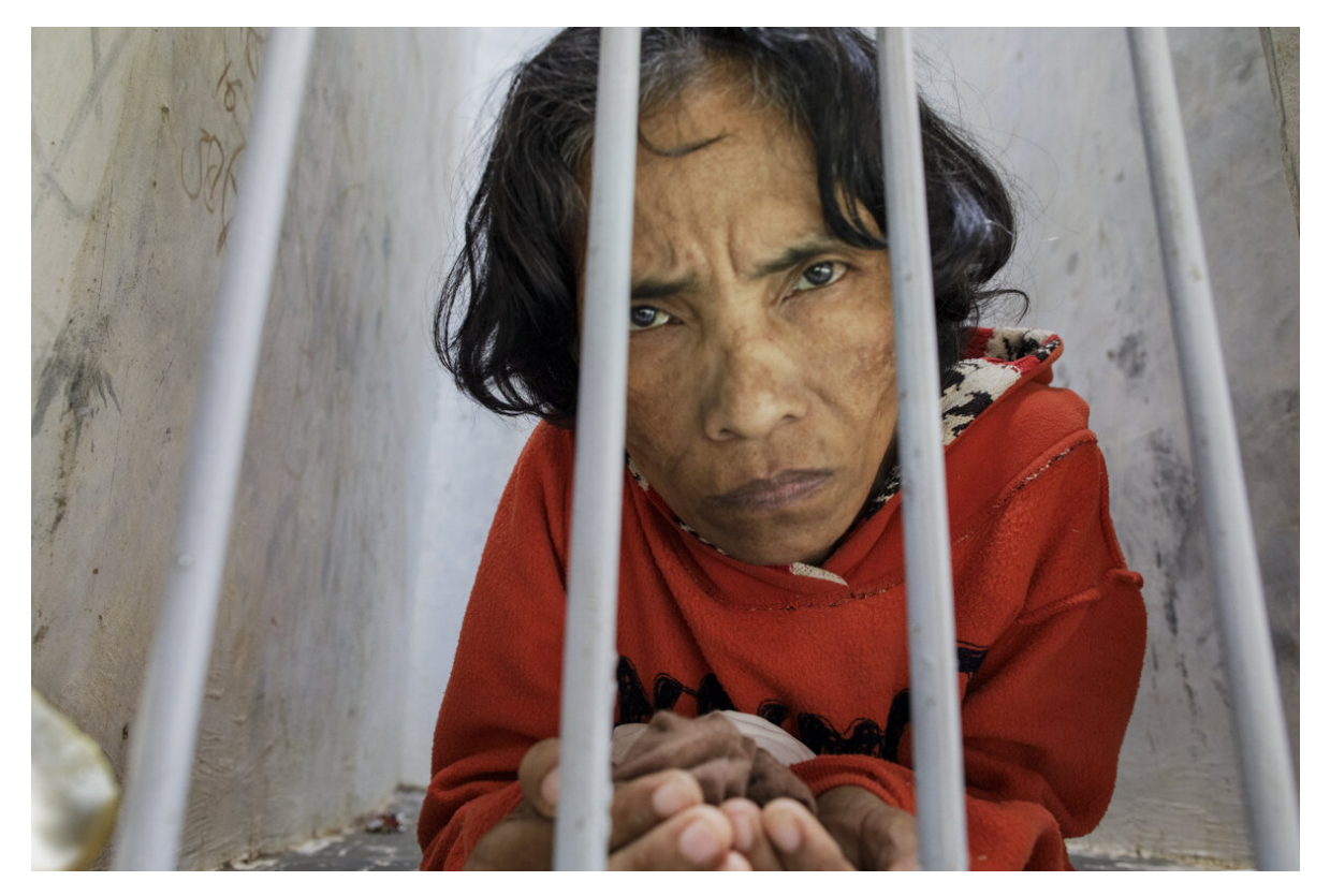
"A woman with a psychosocial disability lives confined in a bare narrow cell at madrasah Ar-Ridwan, a private Islamic healing center in Cilacap, Central Java, Indonesia.