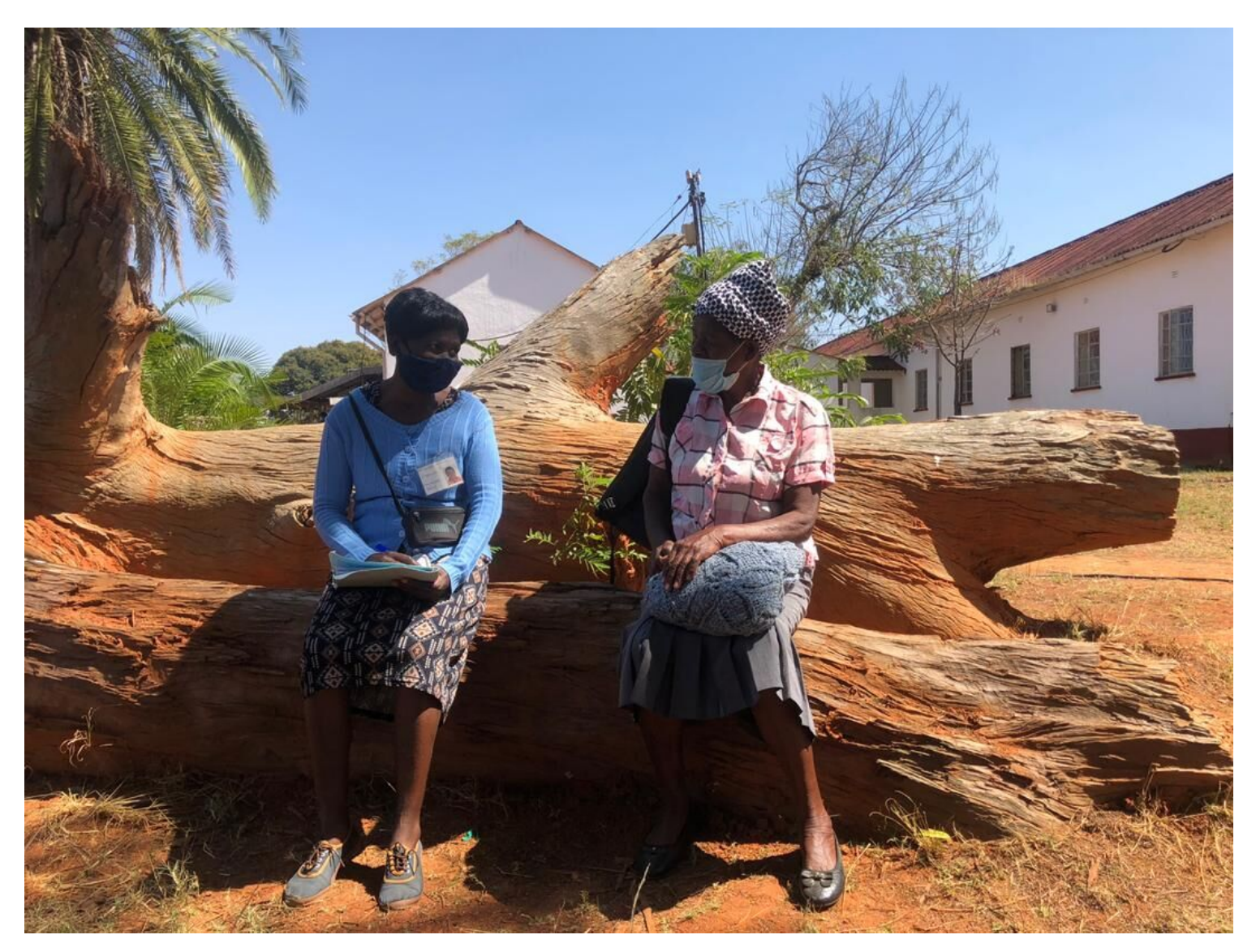
Village health worker providing mental counselling services at one of the hospitals in Zaka district.