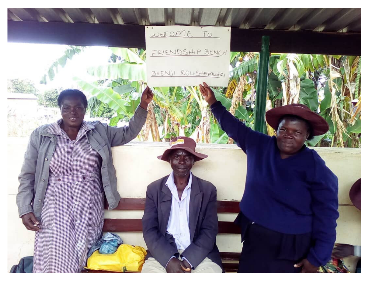
Lay village health sorkers offering mental health services at a rural clinic in Zaka district, Zimbabwe.

well as detect and escalate more severe cases. After screening patients for CMDs using a validated and culturally appropriate tool – the Shona Symptom Questionnaire (SSQ-14) – the lay health workers provide a talk-therapy intervention that combines problem-solving therapy with cognitive behavioural therapy elements. After the one-on-one talk therapy, clients are invited to a peer led support group known as Circle Kubatana Tose (CKT), meaning 'holding hands together'. This safe space contributes to the clients' sense of belonging, reduces stigma surrounding mental health, and further allows for sharing of personal issues. In these CKT groups, clients can engage in income generating activities, relieving some economic burden. Previous trials have demonstrated that the Zimbabwean developed Friendship Bench intervention effectively addresses CMDs in a culturally appropriate way [Chibanda et al., 2016].