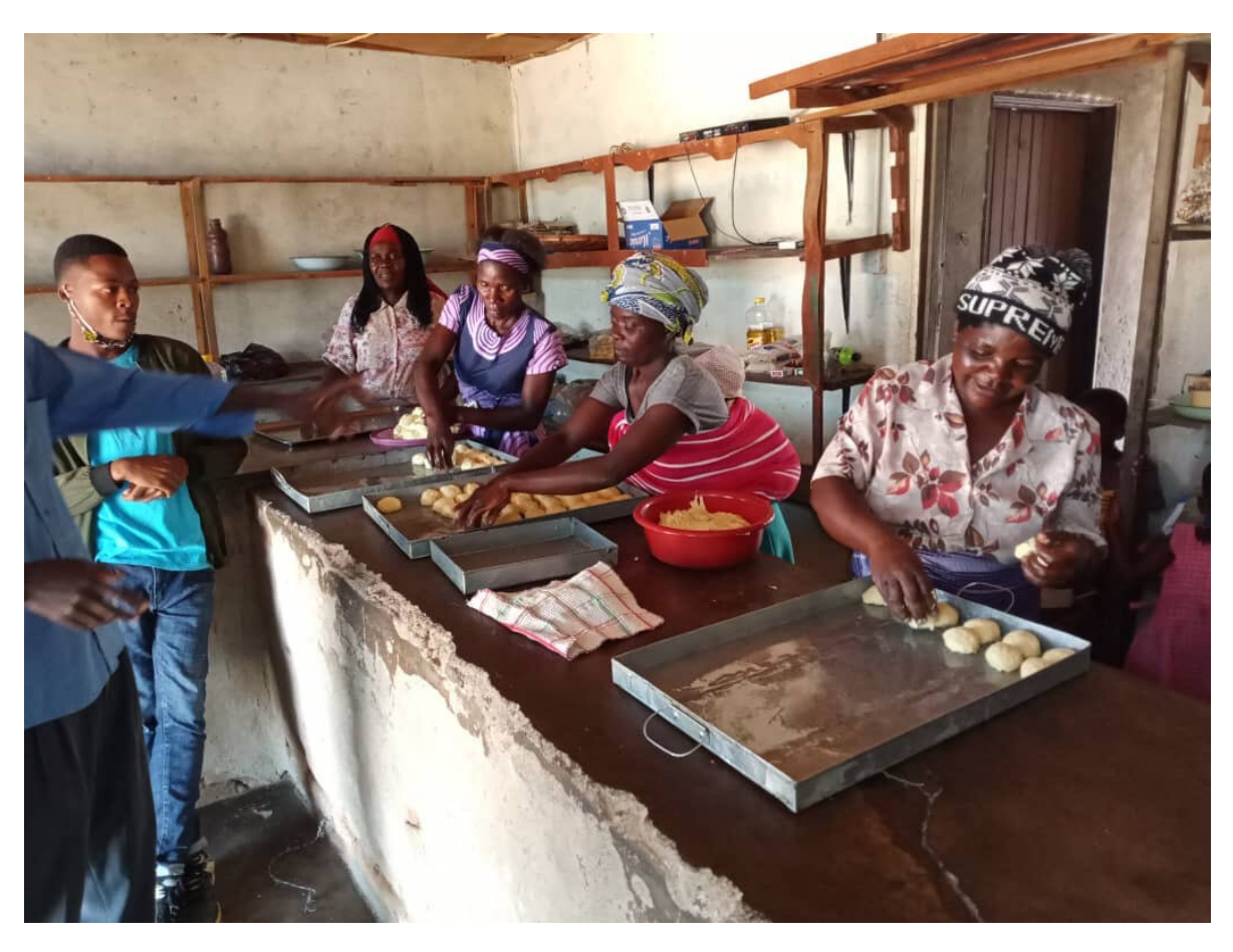
Bun baking initiative started within CKT group, sold for income.